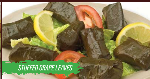
STUFFED GRAPE LEAVES